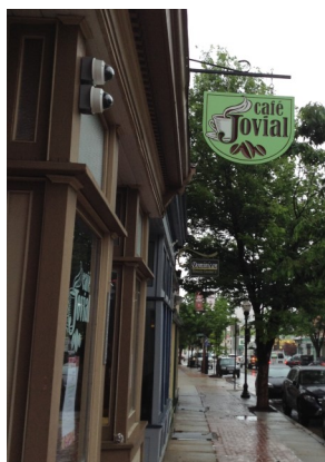
Micro-loan recipient, Café Jovial